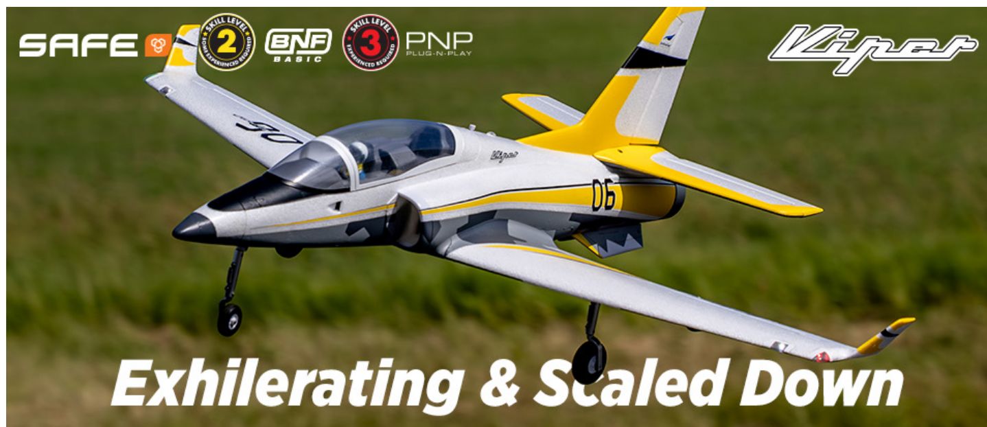
A-EFL07750 / A-EFL07775 Viper 64mm EDF BNF Basic / PNP Sports Jet

The E-flite Viper 64mm EDF is scaled down from the extremely popular 70mm and 90mm models to deliver a jet flying experience unlike any other model in its class. And like the full-scale ViperJet, it sports fighter-jet looks with the stability of a low-wing sport airplane so more pilots can enjoy flying a jet - even if it's your first-ever EDF! It delivers excellent speed, vertical performance, and aerobatic capability while also being easier to hand launch or take off and land than other similar class models - especially the Bind-N-Fly Basic version that's equipped with exclusive AS3X+ and SAFE Select technologies. And both versions feature a Spektrum Avian 70A Smart Lite ESC paired with a high-power outrunner motor and 11-blade 64mm fan to deliver amazing performance with 4S 2200-3200mAh batteries!